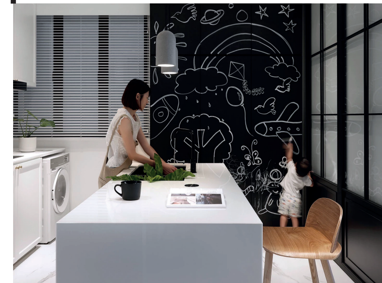
Above: Rose Mill laminates on the ceiling and bar counter add a touch of luxury to a living room Right: A kitchen wall applied with Matt Black Magnetic writeable laminates

With working from home being so prevalent nowadays, the Magnetic series is an asset in making any room in your home, conducive for both study and work.